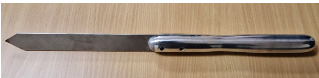
Left: Thin blade parting tool with Aluminium Handle made by Eric Harvey