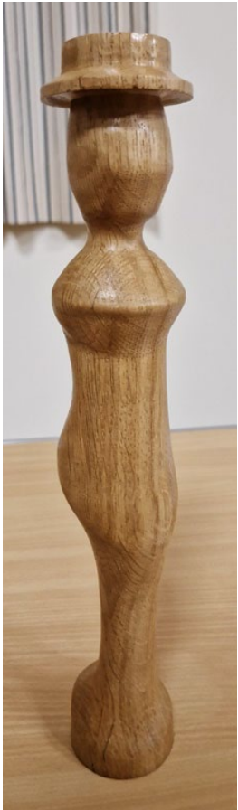
Left: Very tall off centre turned female figure made by John Kirchell